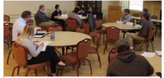
CALP Sandwich Seminar, March 2019.

The Institute is conducting a Student Applied Learning Entrepreneurs information session on Thursday, September 12, from 7pm to 8pm in Corey 209.