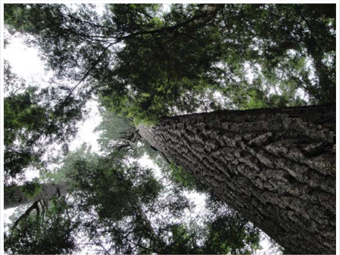
Cindy Santner '76

During the summer alumni had the opportunity to share pictures taken throughout the week at Raquette Lake as part of our alumni photo contest. Pages 3 and 6 each share the two overall winning photographs. The pictures that follow are a small representation of other entries. It was wonderful to see all of the beauty and joy through someone else's vernacular.