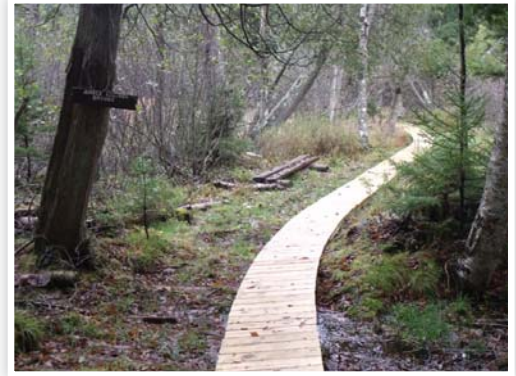
Ankle knocker bridge

http://www.youtube.com/watch?v=ulCSjPWVncs