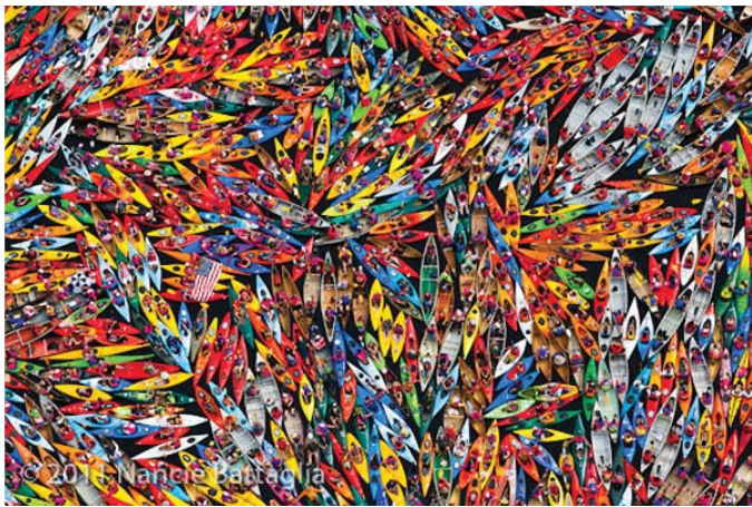
One Square Mile of Hope raised over $70,000 for the Susan G. Komen for the Cure.

What happens when a small village in the Adirondacks takes up the challenge to reclaim the Guinness Book of World Records title of most paddle craft assembled on one lake? You get 1,925 canoes and kayaks to respond and raise thousands of dollars for the Susan G. Komen Foundation for breast cancer research. Eighteen of those boats were canoes from the Raquette Lake Outdoor Education Center, paddled by students in residence here for the weekend from Utica College.