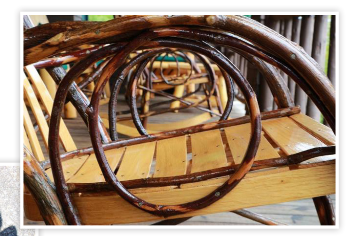
Photos from the digital photography course above Amphitheather construciton below right Art and art history student web below left