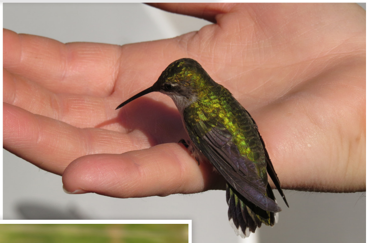
Wings on Raquette Lake