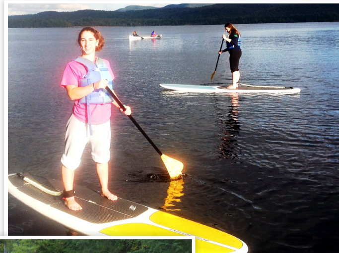
Stand up paddle boards in use above

The smoke hosue at Camp Huntington gets a new roof