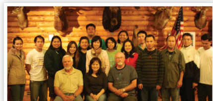
Visiting Thai teachers and administrators

The three days spent on Raquette Lake were a highlight of the trip. The group spent their first day touring and learning the history of Camp Huntington. The evening consisted of a few team building activities, followed by a campfire enjoying s'mores for the first time. Day two introduced the Thai teachers to the low ropes course and boating. Having never kayaked before, it was a thrilling experience for them to use the boats; many participants even went out the second morning to watch the sunrise.