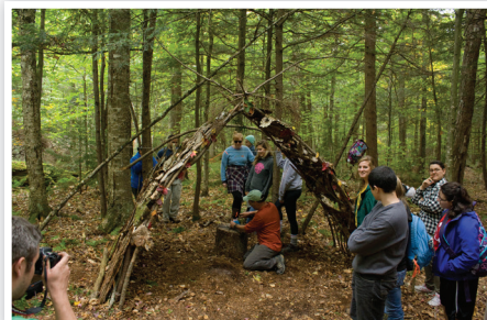
All photos above are courtesy of Rob Licht