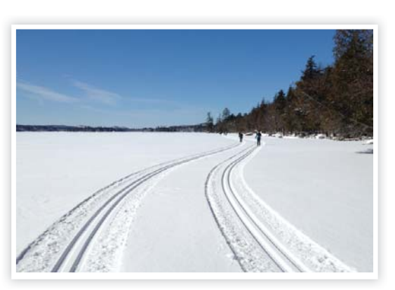
Ski tracks laid in fresh snow with our new track setter

It was the winter that wasn't, as most of you from the Northeast know only too well. We had to bring the first January group in through the back way across Golden and Silver Beaches because of lack of ice. Shortly thereafter, the ice road opened, and everyone else came and went across it. Most groups were able to get out on skis or snowshoes at least a little, but the conditions were far from what we have come to expect from the Adirondacks. The good