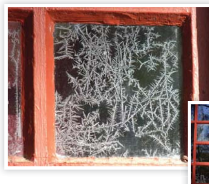
Jack Frost works his magic on the windows of the Chalet.