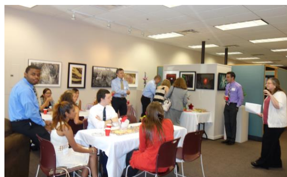
The Institute for Civic Engagement hosted a welcome reception for student leaders on September 24 at Main Street SUNY Cortland – the institute’s offices located at 9 Main Street.

By bringing these programs to its 64 campuses, SUNY’s goal is to increase the number of SUNY graduates from 93,000 to 150,000 by capitalizing on the power of learning by doing. http://www.suny.edu/applied-learning/ http://www.suny.edu/powerofsuny/appli