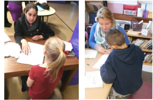
First-year education majors work one-on-one with children in Virgil Elementary School.