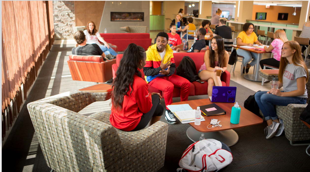
Corey Union ground floor (student union)