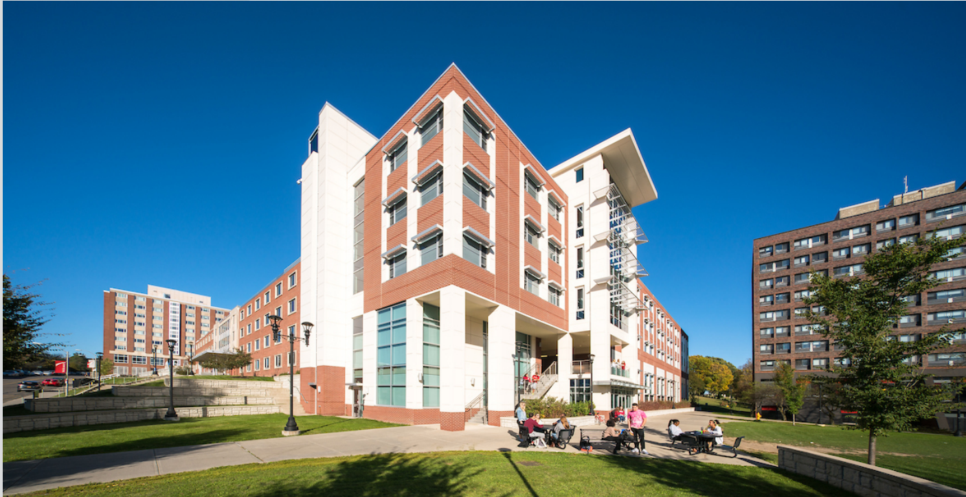
Dragon Hall (student residence)