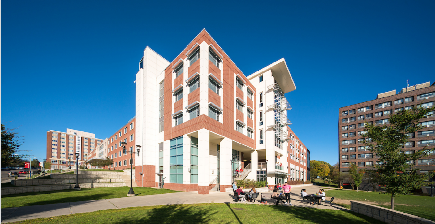
Dragon Hall (student residence)