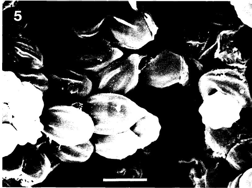
Fig. 5. SEM of basidiospores of Clitopilus chalybescens (from holotype). Bar = 5 \mu m.