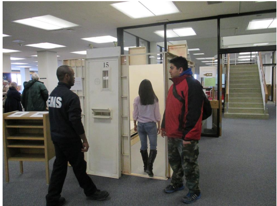
Students experience the cell firsthand

The number of inmates held in solitary confinement in the United States has been extremely problematic to determine. It is commonly said that solitary confinement inmates are more likely to commit suicide than traditional inmates. If the question is why you should care, then one answer would be that it simply violates human rights, which is a matter of social justice. In some instances, the prisoners have mental health issues that they are dealing with that only worsen during segregation. One of the most surprising points is that some inmates have been in solitary confinement for many years.