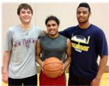
(The Red Dragons-Winners!)

On December 7, M.O.V.E. hosted a 3 v 3 basketball tournament in Park Center. With over 70 players and spectators in attendance, and over $100 raised for their organization, this event was a huge success.